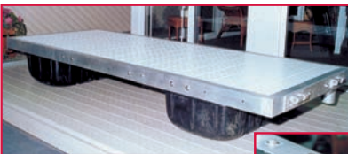
Close-up of floatation device on Dream®Dock Floating System