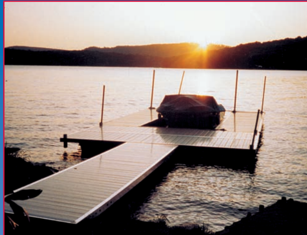
Dream®Dock Systems are available for floating applications in various configurations.

With Dream®Dock, you can enjoy the sunshine without taking the heat. Its durable vinyl surface is UV-resistant. With its exclusive, slip resistant surface design, you can be sure your Dream® Dock is barefoot friendly!