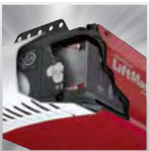
12V DC battery fits neatly inside the opener

The EverCharge® Standby Power System will operate the garage door opener for 40 cycles within a 24-hour period and recharges automatically when the power comes back on.